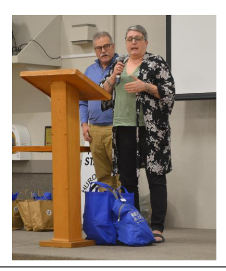
Sarnia Lambton Esso Annuitant Club Newsletter October 2022