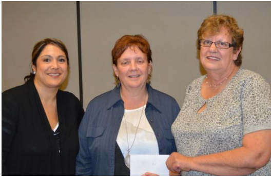
50 / 50 Draw Charity Women's Interval Home